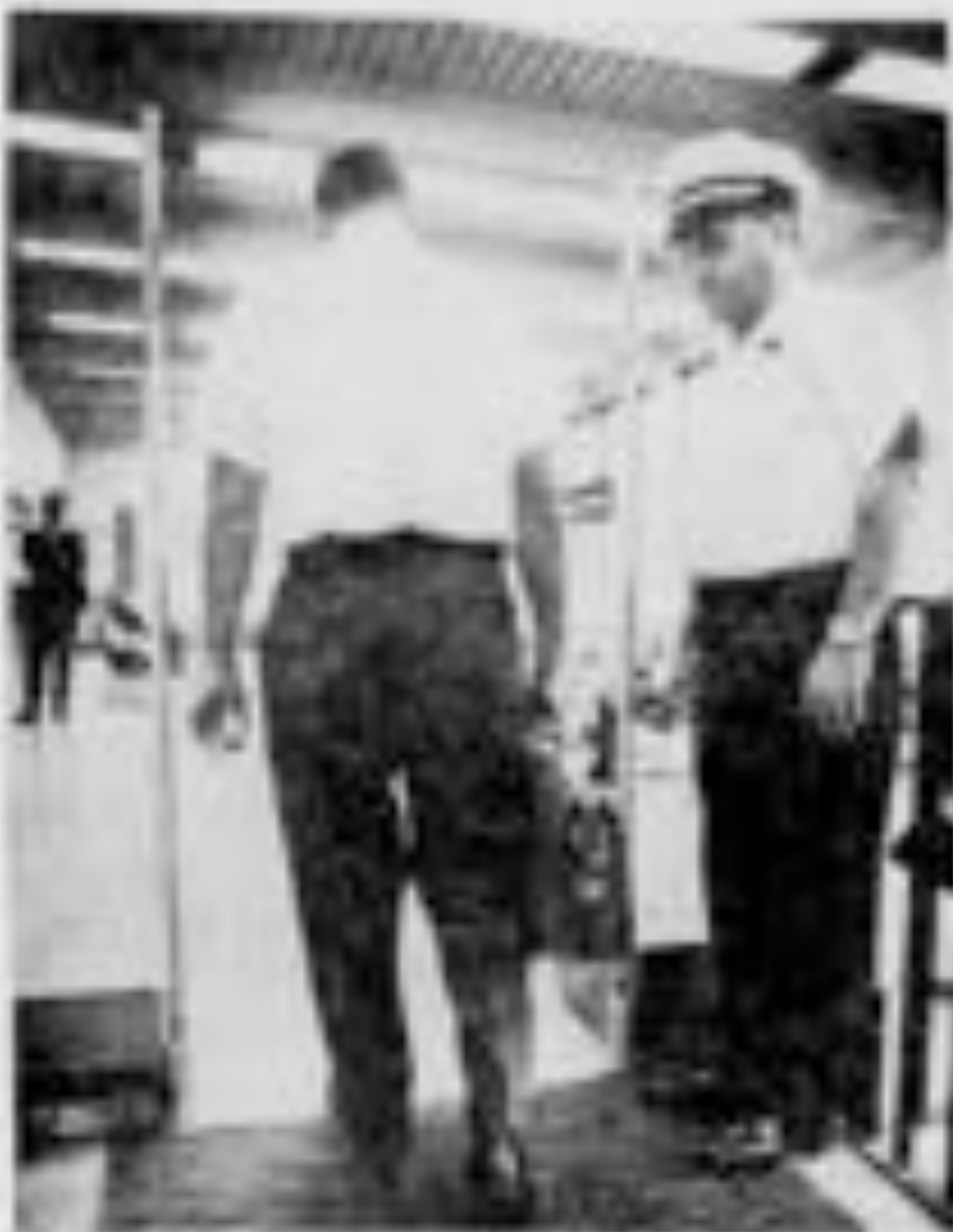
With this man is a report of a ship's crew, according to the newspaper. Photographed with permission.