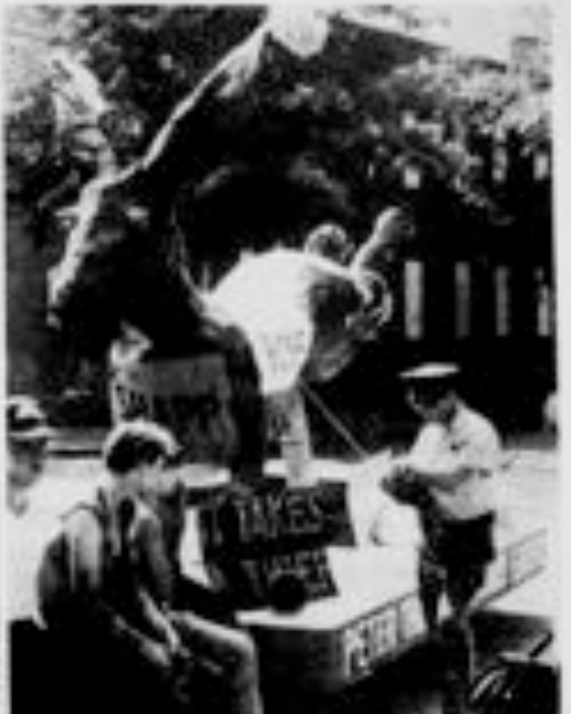
"TAKES" takes up his duties as shyster.

By the Editors The Delaware County Daily Times is pleased to announce the arrival of a new and exciting character in the media world. Peter, the shyster, has arrived. Peter is a small, dark, and very cunning creature who has been seen in various places, including the offices of the Delaware County Daily Times. Peter is known for his ability to manipulate the media and to cause confusion and controversy. He is a master of disguise and is always ready to pounce on an unsuspecting victim. Peter is a real threat to the integrity of the media and to the public. We urge all readers to be on their guard against Peter and to report any sightings to the Delaware County Daily Times. Peter is a shyster and he deserves to be exposed. We will continue to keep you informed of Peter's activities and to fight against his influence. Peter is a shyster and he deserves to be exposed. We will continue to keep you informed of Peter's activities and to fight against his influence.