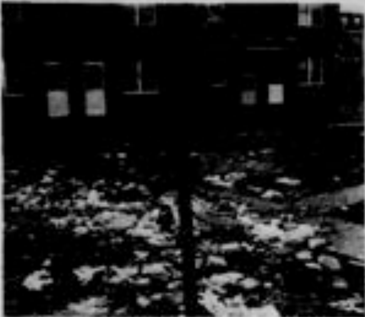
Trash and garbage that is piled in front of a house in the East Pennock housing project.