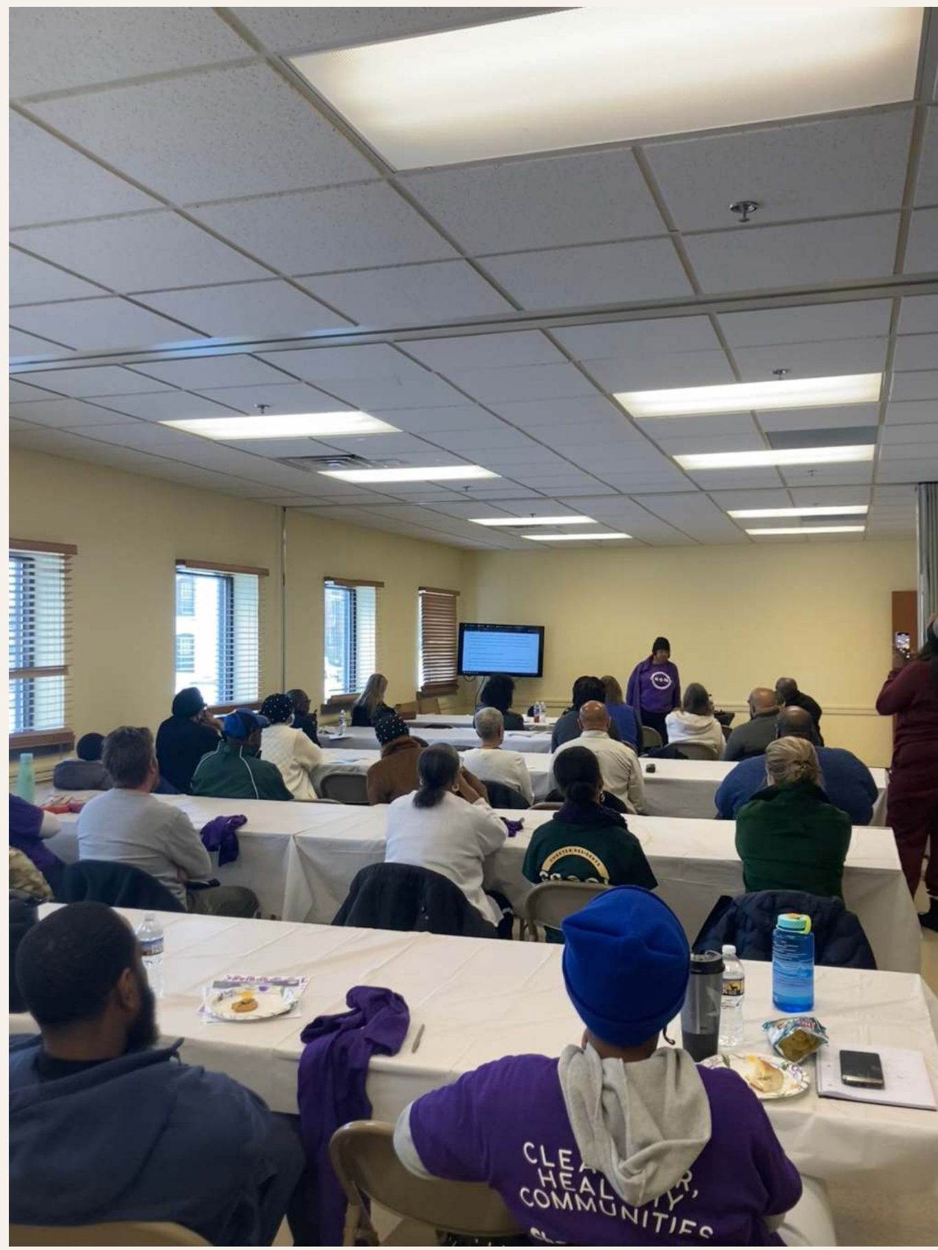
The community opposes LNG!